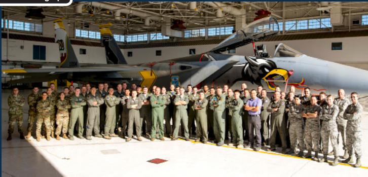
Members of the 144th Operations Group pose with Ukrainian pilots in the 144th Maintenance Hangar Sept. 8, 2019. The visit is part of the State Partnership Program between Ukraine and the California Air National Guard. This 26 year partnership helps foster relationships and build trust, with the ultimate goal of increasing readiness and training for both countries.

This funded monthly newsletter is an authorized publication for members of the United States military services. Contents of this newsletter are not necessarily the official views of, or endorsed by, the U.S. Govt., Dept. of Defense, Dept. of the Air Force, the National Guard Bureau, or the 144th Fighter Wing.